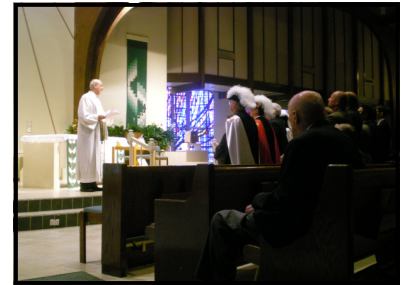
One Good Priest Can Make A Difference